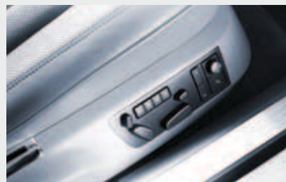
Electric seat adjustment