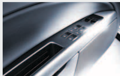
Electric window lifters