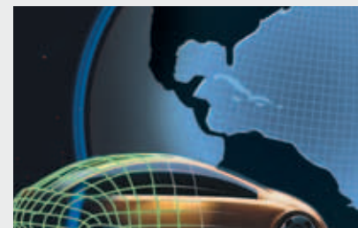
Powerful support for energy components